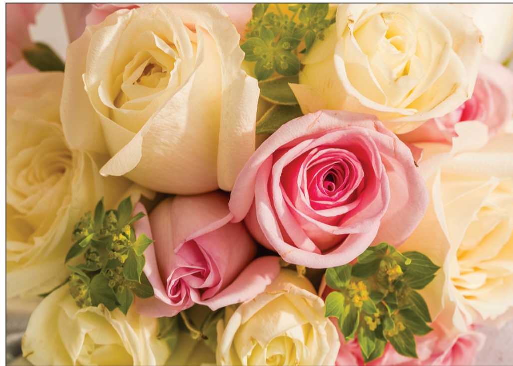
Couples are moving away from traditional centerpieces to floral chandeliers and curtains made of blooms for their weddings.

Couples are urged to speak with their florists about the innovative ways they can make flowers an even more awe-inspiring component of their weddings.