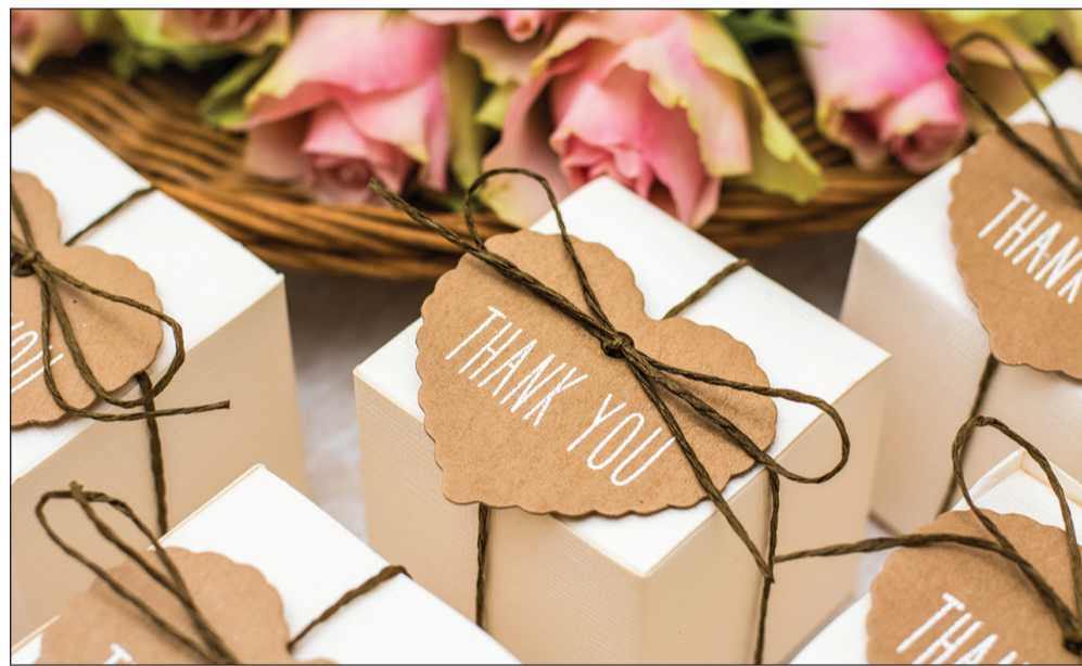
Like many other elements of the wedding, favors are evolving to help give weddings a custom feel.

Wedding favors are changing to keep up with the times and keep guests feeling extra special.